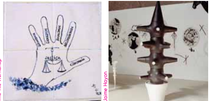
The Tile Workshop

■ Walls for Ideas: International ceramic projects promoting social change and human rights through the arts